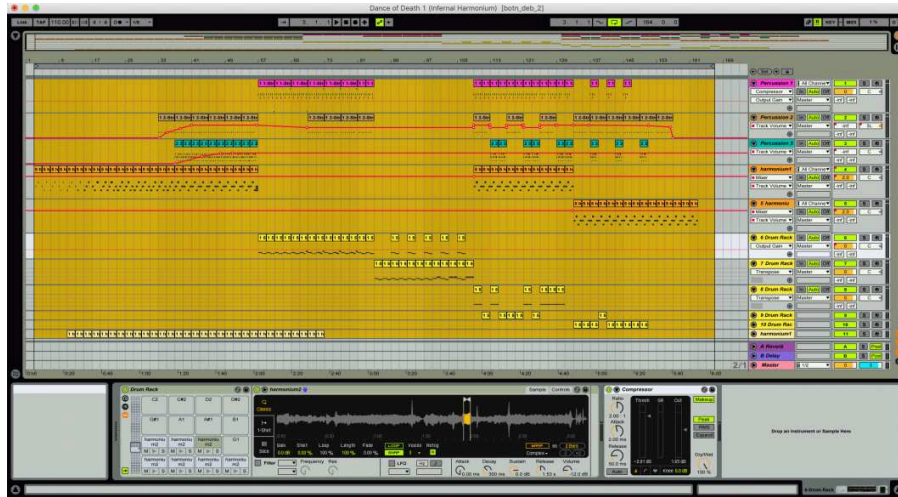
Figure 4. Robert Bentall, A Portion of the Score for 'The Ballet of the Nations' Visualised in Ableton Live, 2018.

block of sound (Fig. 4) and some notes can be represented within a digital piano roll (Fig. 5). The sounds in the score are either played into the computer with a MIDI controller (Fig. 6) or a MIDI keyboard (Fig. 7).