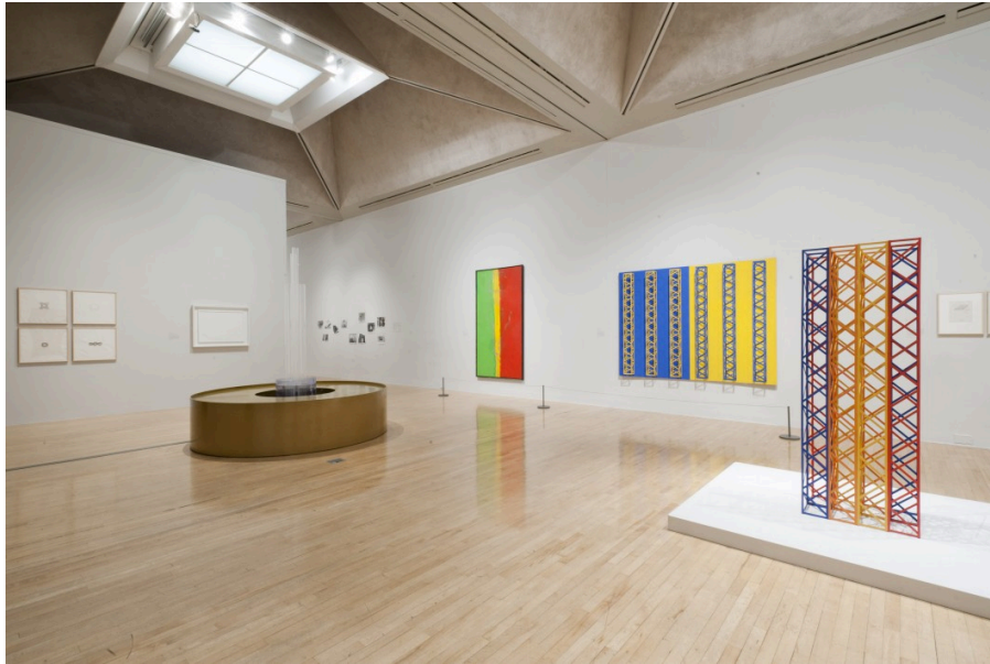
Figure 4. Migrations: Journeys into British Art, Tate Britain, 2012, installation photograph.