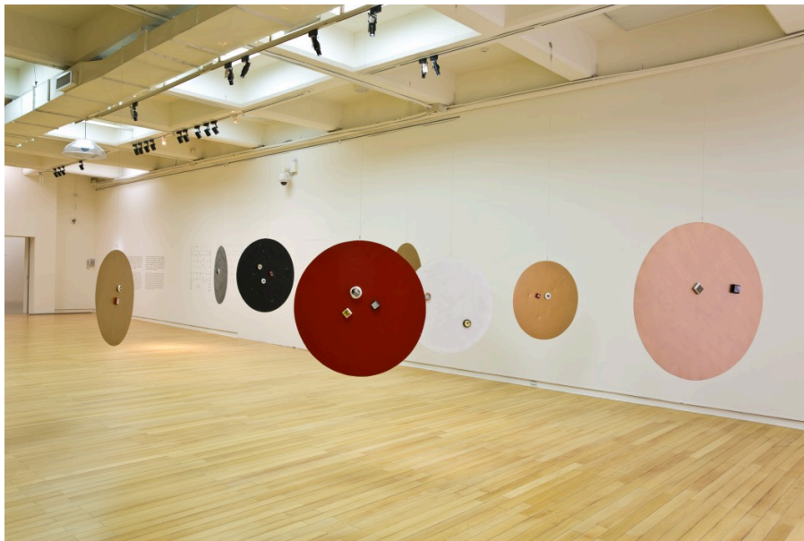
Figure 5. View-Point: A Retrospective Exhibition of Li Yuan-chia, 2014, installation photograph.