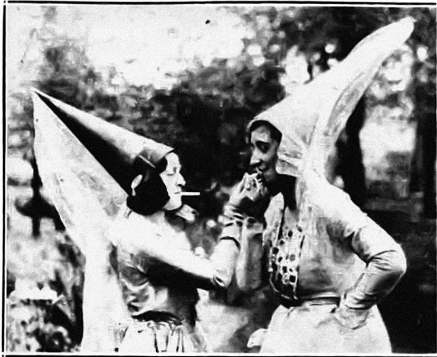
An amusing photograph taken at the pageant. "Time's Daughters," given at Radford College.