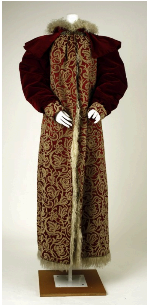
Figure 7. probably French, Evening Robe, 1890s, silk, fur. Collection of The Metropolitan Museum of Art, New York, Gift of Miss Cornelia Van Aukin Chapin, 1953 (C.I.53.60.8).

( fig. 11 ). A dress Virginia Woolf wore in 1926 bears some resemblance to these styles; it features enlarged, stylized flowers and slightly billowing sleeves ( fig. 12 ).