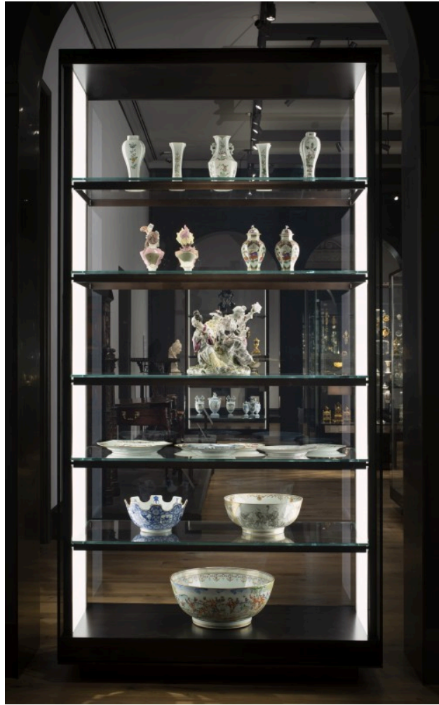
Figure 17. Case featuring Chinese Musicians, British Galleries, The Metropolitan Museum of Art, photographed November 2021.