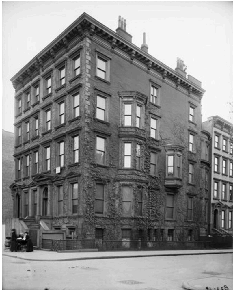
Figure 14. House of John L. Cadwalader. 3 East 56th Street, on the site of Trump Tower, Fifth Avenue, 1915.