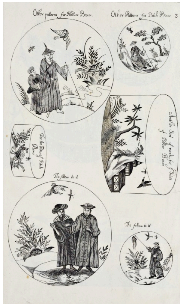
Figure 11. John Stalker, Patterns for Japan-work, in George Parker and John Stalker, A Treatise of Japaning and Varnishing (London, 1688), 1688. Collection of the Getty Research Institute. Digital image courtesy of Getty Research Institute (public domain).