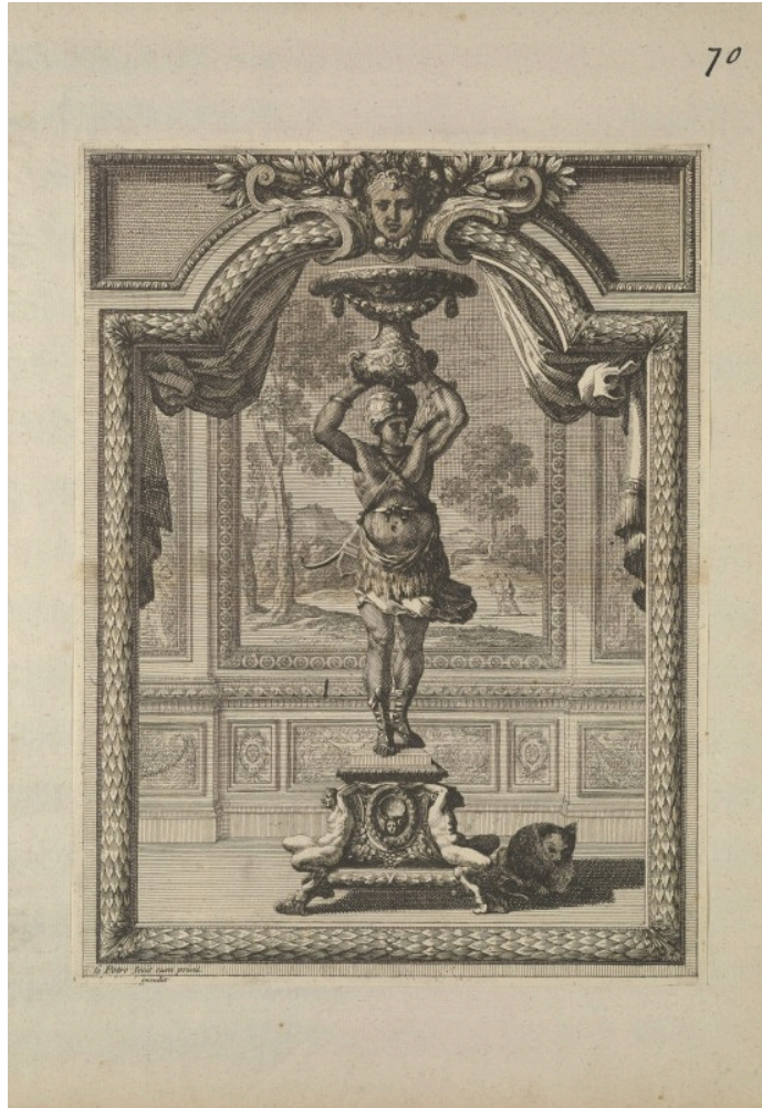
Figure 9. Jean Le Pautre, A Large Guéridon, France, late seventeenth century. Collection of the Getty Research Institute. Digital image courtesy of Getty Research Institute (public domain).