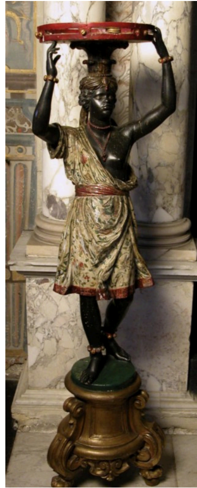
Figure 2. Unknown artist, One of a pair of torchères, circa 1675, painted and gilt softwood, 122.6 × 35 cm. Collection of the National Trust, Knole, Kent (NT 129512).

The stands at Dyrham Park do not share these distinct visual connections with the sets at Ham House and Knole. However, a letter dating to 1700 suggests that they could also date to the latter part of the seventeenth century (fig. 3). On 5 December, John Povey wrote to his uncle, Thomas Povey, from Dyrham Park in Gloucestershire. John Povey was the guest of William Blathwayt, another of Thomas Povey's nephews. Throughout the letter to his uncle, John Povey describes the various locations in the house where the paintings and pieces of furniture which had once been in Thomas Povey's collection were now on display. A few years earlier, finding himself in difficult financial circumstances, Thomas Povey had sold a number of pieces to his nephew William Blathwayt, who had recently completed substantial renovations of the house at Dyrham Park. 13