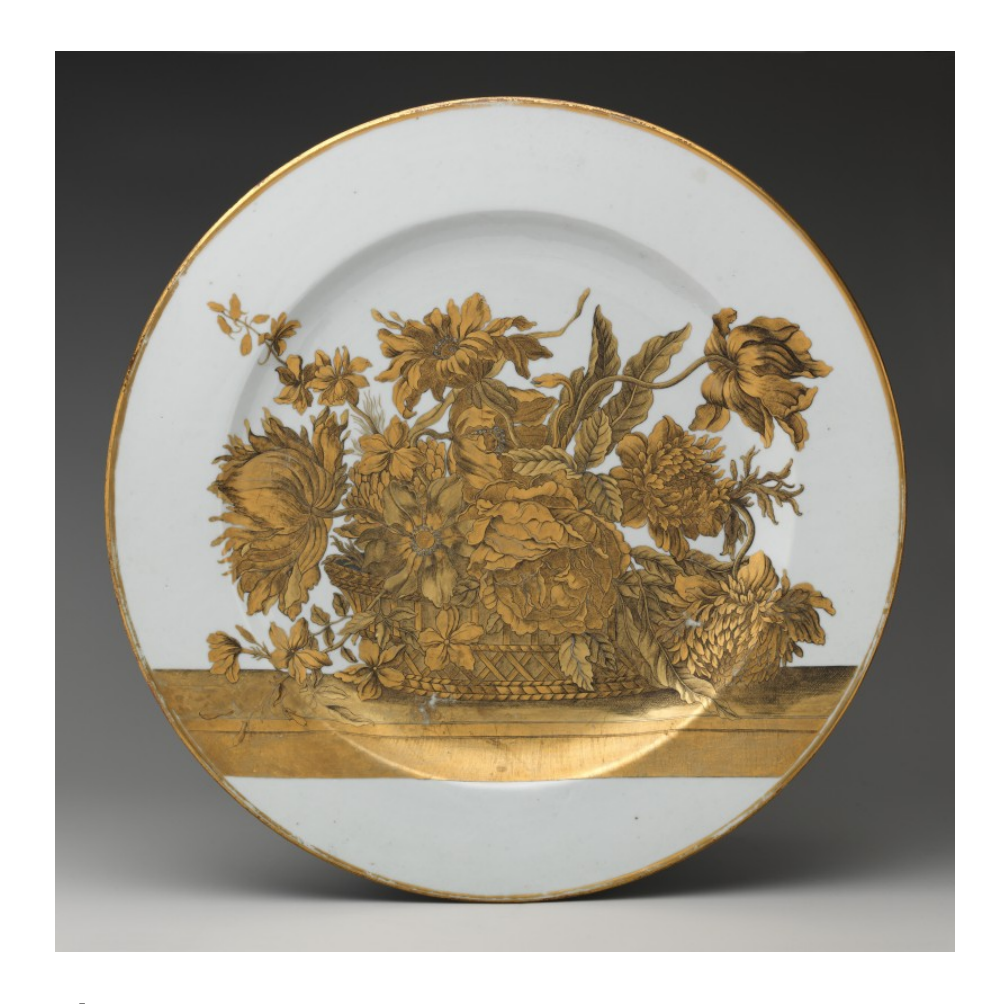
Figure 10. After engravings by Jean-Baptiste Monnoyer, Chinese export porcelain plate (set of 2), enamelled on the reverse for Robert French, circa 1735–1740, hard-paste porcelain with gilding, 4.8 × 38.7 cm. Collection of The Metropolitan Museum of Art, New York (62.187.1). Digital image courtesy of The Metropolitan Museum of Art, New York / Photo: Peter