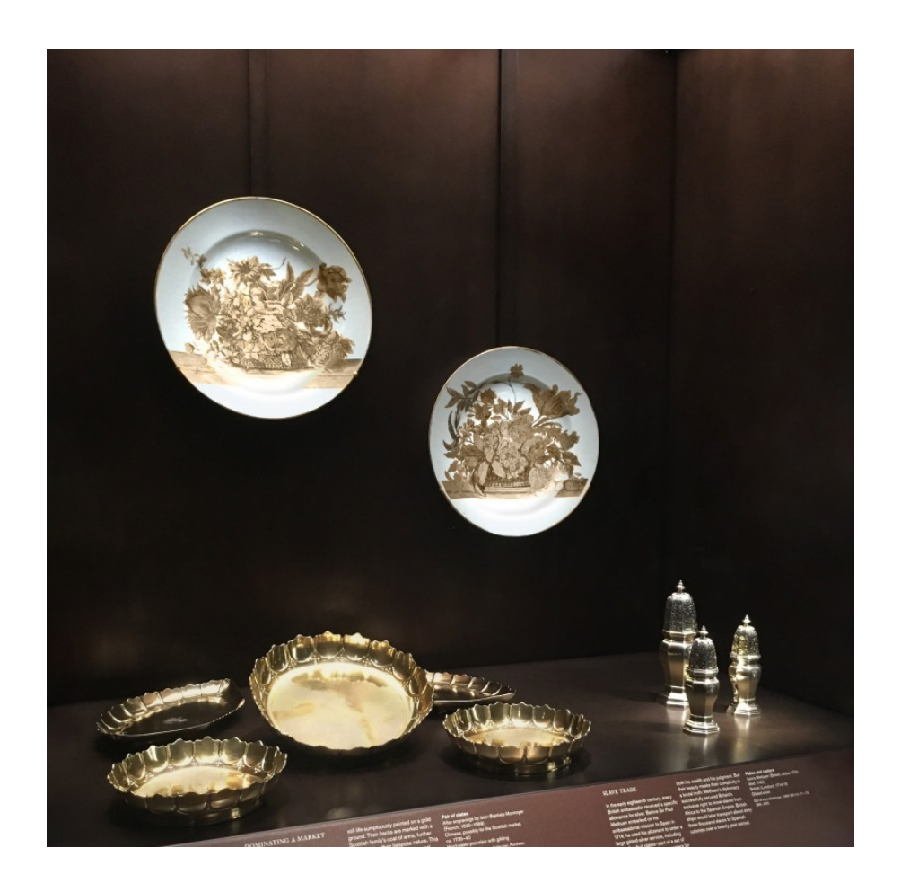
Figure 9. Methuen asiento silver and Chinese export porcelain of Robert French, installed in the British Galleries, February 2020, case design by Roman and Williams, The Metropolitan Museum of Art, New York.