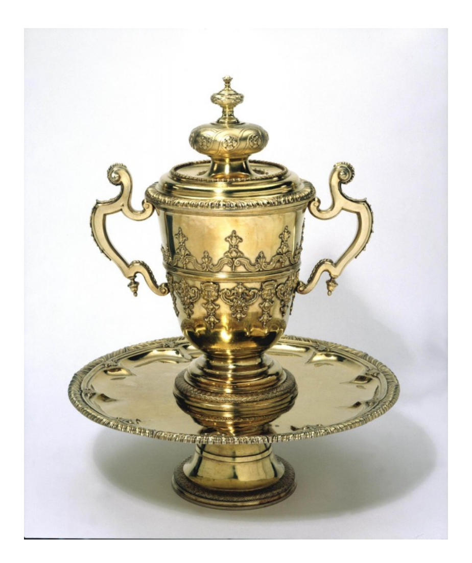
Figure 1. Phillip Rollos, The Bingley Cup (Phillip Rollos produced an identical pair for Methuen, without the salver, in 1714), circa 1714, silver-gilt , 38 \times 35.5 \times 20.5 cm. Collection of the Victoria and Albert Museum, London (M.30:1-2008).