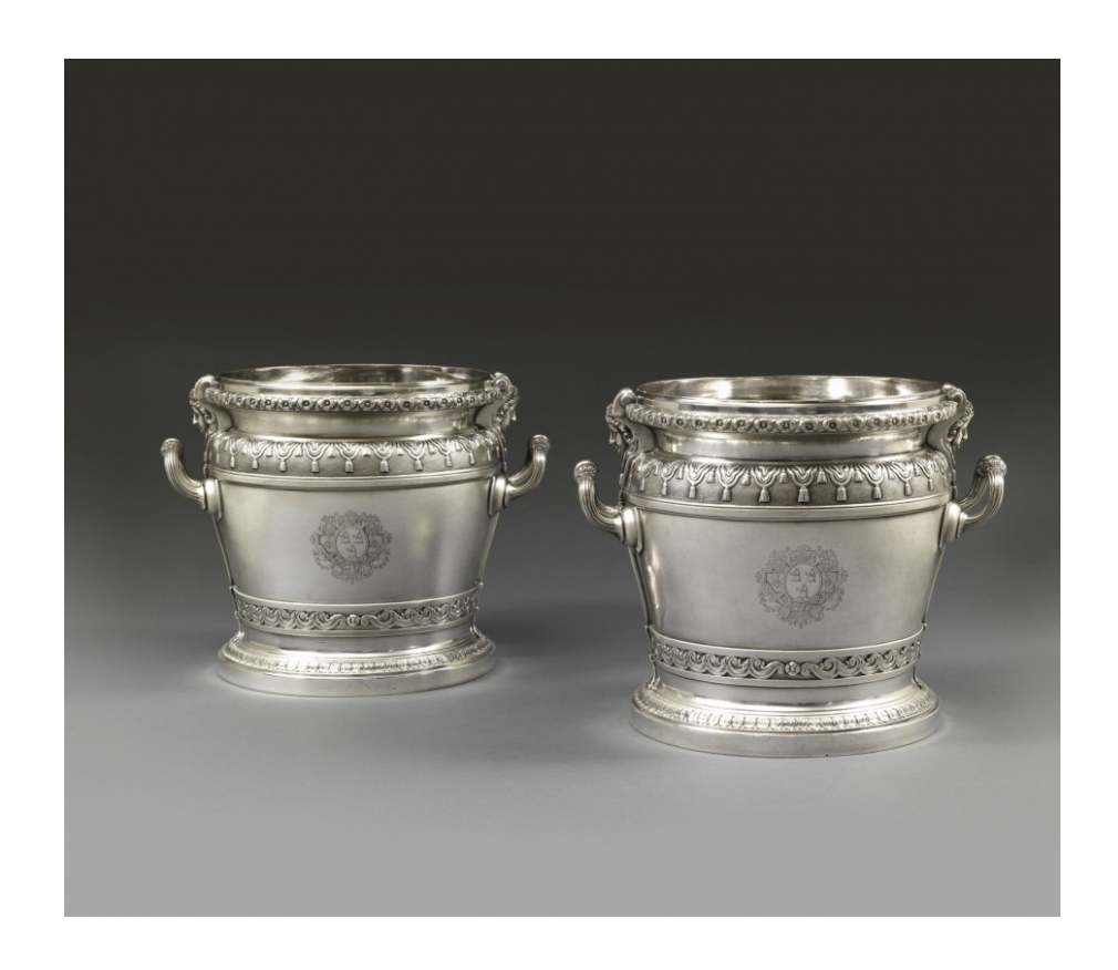
Figure 2. Lewis Mettayer, Wine coolers made for Paul Methuen, 1714, silver. Private Collection.