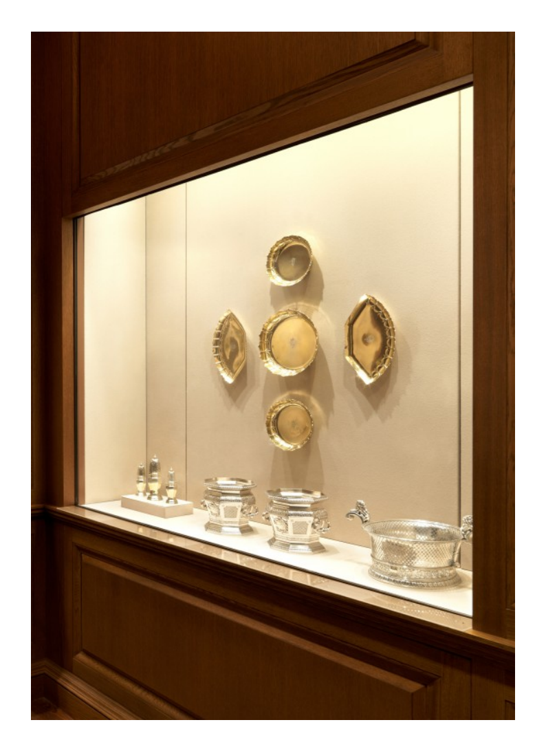
Figure 8. Methuen asiento silver shown in the "Galleries of English Decorative Arts" installed in 1995, photographed before deinstallation in 2016 , The Metropolitan Museum of Art, New York.

As I found by researching the first owner, the ambassador Paul Methuen (1672–1757), the silver objects had been manufactured for use in entertaining Spanish officials during negotiations by which the new nation of Great Britain obtained the asiento contract, the monopoly to transport enslaved Africans to the Spanish empire. The asiento itself had been granted to Britain from France in 1713, and the negotiations in Madrid in 1715 were for the new Whig government to establish the details of the arrangement on their own terms. The intended function of the silver was never fulfilled: owing to illness, Methuen returned prematurely from his embassy, leaving an assistant to successfully negotiate the agreements through bribery rather than magnificent hospitality. Nevertheless, the casters and dishes are